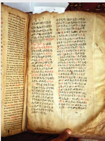
Ethiopic parchment manuscript from Eritrea, Sàra'e, including a 15 th cent. inventory of manuscript books with mention of canonico-liturgical and hagiographical collections.

Assessed linguistic and historical evidence as well as fresh data relating to the Alexandrian Church recently come to light corroborates the hypothesis of a strict dependence of the Ethiopian scribal practice and written culture upon that of Christian Egypt, which early provided Aksum with manuscripts transmitting Greek written knowledge. Yet the relatively recent date of most Ethiopic manuscripts (only two or three Four Gospels books could predate the 12 th cent.) and the scholarly assumption of a mostly Arabic-based Ethiopian Christianity combined with the misleading effects of updatings and rearrangements in the course of time have conspired to bring about a substantial underestimation of several archaic features of the Ethiopian scribal and manuscript practice.