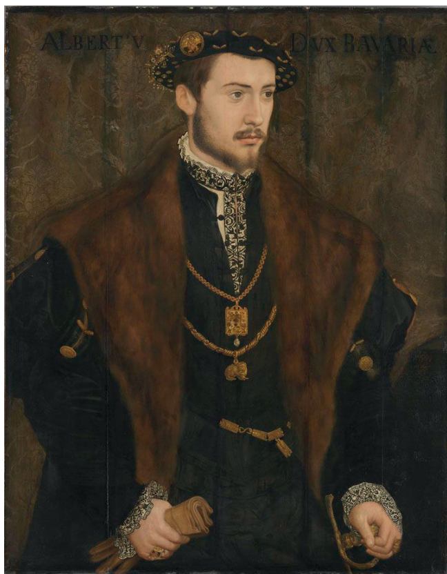
Fig. 2: Albrecht V, Duke of Bavaria (1528–1579), painted by Hans Muelich in 1545.