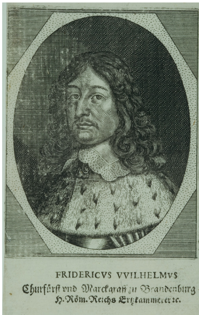
Fig. 1: Frederick William, Elector of Brandenburg (1620–1688), copper engraving of the seventeenth century.