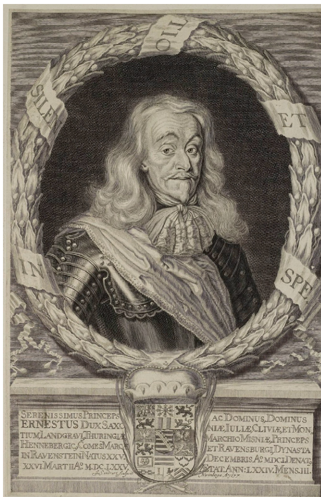
Fig. 3: Ernest I, Duke of Saxe-Gotha and Saxe-Altenburg (1601–1675), copper engraving by Jacob von Sandrart, 1677.

Due to the personal involvement of two Munich librarians, Emil Gratzl and Karl Dachs, the number of Oriental/Islamic manuscripts continued to increase in the second half of the twentieth century, growing by 140 and 1,492 manuscripts respectively. Dachs's interest in copies of the Qur'an deserves special mention here, as he was able to buy many important pieces at a time when precious ones were still affordable. Currently, the Library holds 179 complete copies or fragments of the Qur'an.