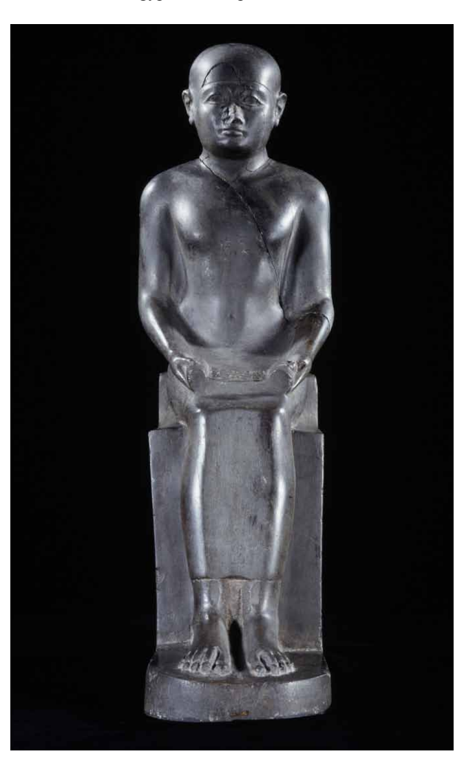
Fig 3: Imouthes, Paris, Louvre (Ptolemaic Age, 332–30 BCE).

of medicine Asclepius had a perfect Egyptian counterpart in the god Imouthes / Imothep; and the miracle inscriptions of Epidaurus have their Egyptian counterparts represented by Egyptian inscriptions with tales of miracles performed by the god which are similar in tone and content. In both cases we have the god who works wonders, worshippers who make offerings at the shrines, recording the works he performs; sometimes the sick were healed, sometimes they were addressed by the god. One must also notice that besides